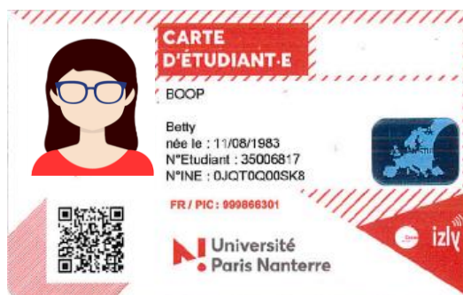
Example of a European Student Card – Université Paris Nanterre

The European student card is a product of the European Student Card initiative. It is a student card issued by an institution, supplemented by a European number, a QR code and a hologram.